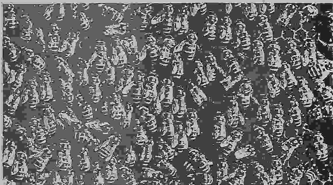
Honey bees on a comb, as seen through the glass of an observation hive. Artificial insemination may permit genetic improvement of the honey bee. (0962X) 130-19

Inbreeding may cause shot brood, a situation in which the colony loses some of its viability because fewer than normal numbers of fertilized eggs develop into workers. Instead, many of the fertilized eggs develop into abnormal bees known as diploid males—